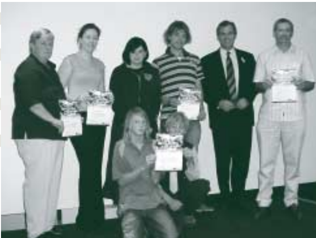
Schoolies Week 2005 awards

For the last three years, the PDPC has funded strategies in response to community concerns about the risky behaviours of young people during Schoolies Week, including providing information to students and parents, advertising and assisting communities to manage the event.