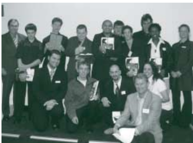
Transport Industry Presentation Night May 2006

These positive outcomes are the result of collaboration with key stakeholders in each of the local communities, in particular, the Brimbank Melton, Inner North and South East Local Learning Employment Networks; youth and community agencies; schools and Neighbourhood Renewal projects. Delivery of the program by Connectus staff has allowed them to develop strong relationships with young people and support them to achieve their goals and aspirations.