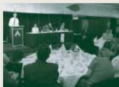
Key Stakeholder Seminar, November 2002