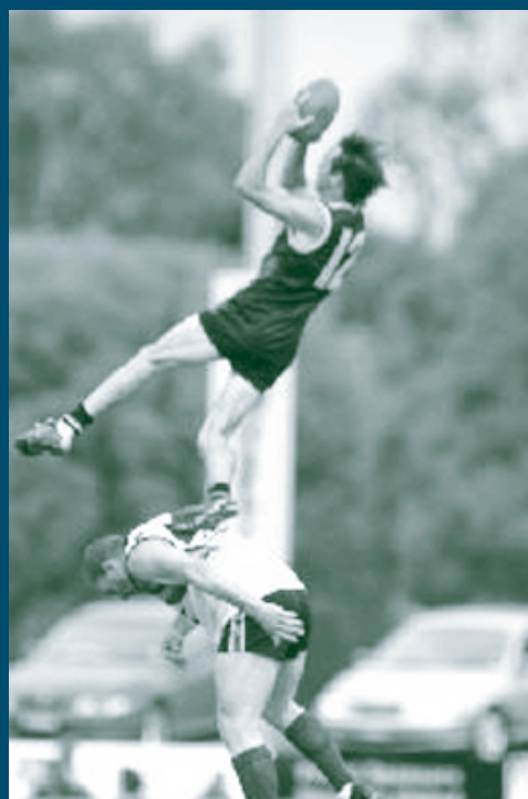
VAYSAR Sporting Carnival, October 2002

VAYSAR is currently organising a series of 3-on-3 basketball carnivals to be held around Victoria, commencing in Melbourne late April. The Code of Conduct will also underpin these carnivals.