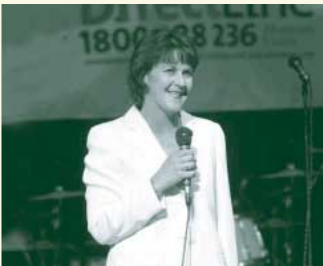
Minister for Health, Bronwyn Pike at the launch of the PDPC's Summer Events Campaign

Once again the Summer Events Campaign provided information and activities at the biggest youth events around Victoria. Now in its second year, the 2002 – 2003 Summer Events Campaign was launched by the Minister for Health, Bronwyn Pike, on 17 December 2002 at Maribyrnong Secondary College.